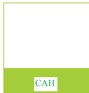
6 X 18