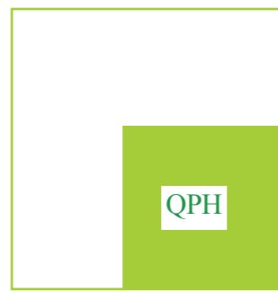
12 X 12