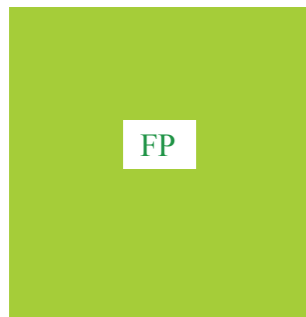
25 X 18