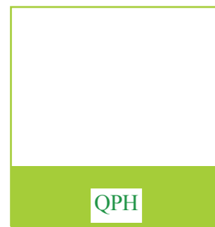
7 X 18